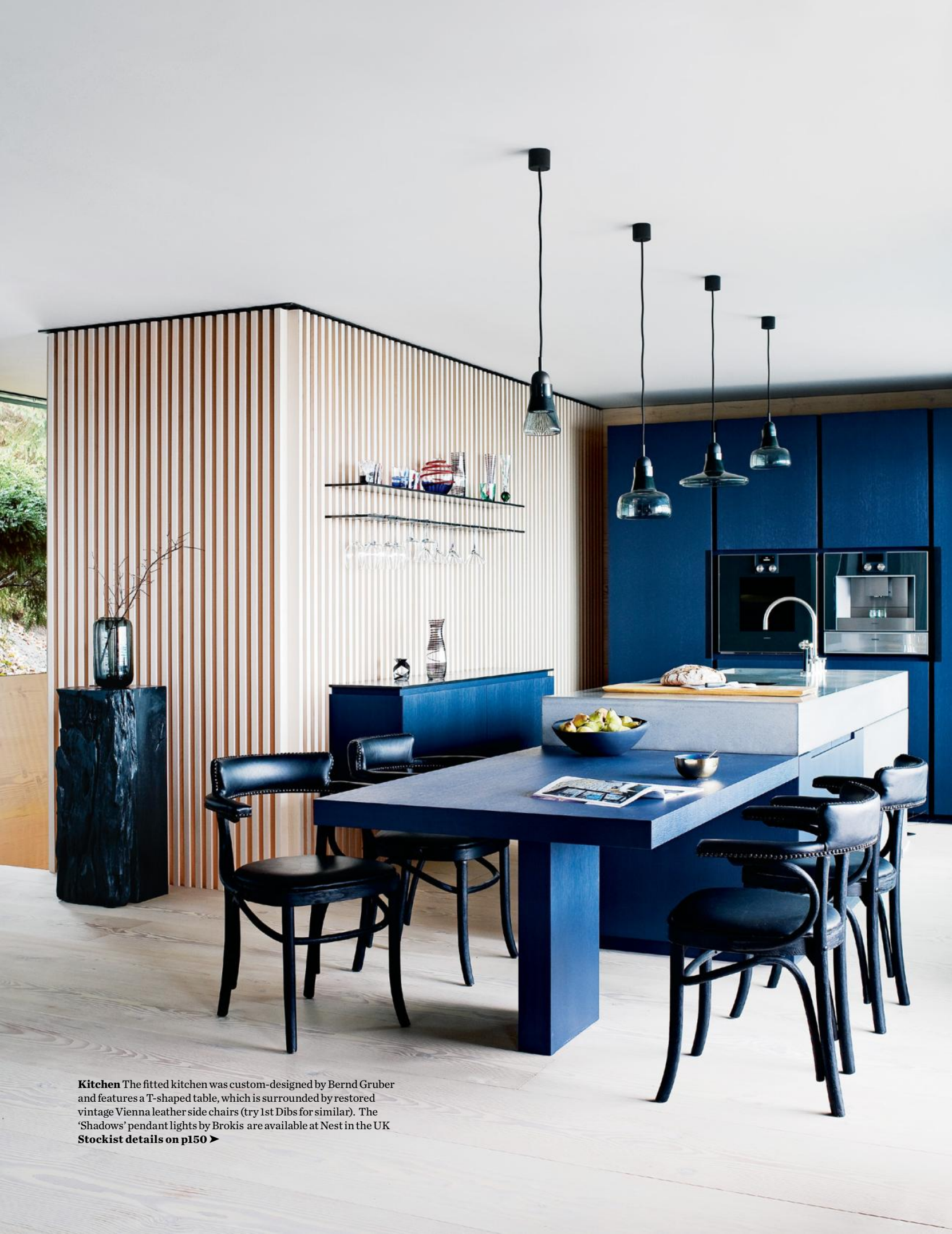
Kitchen The fitted kitchen was custom-designed by Bernd Gruber and features a T-shaped table, which is surrounded by restored vintage Vienna leather side chairs (try 1st Dibs for similar). The 'Shadows' pendant lights by Brokis are available at Nest in the UK Stockist details on p150 ►